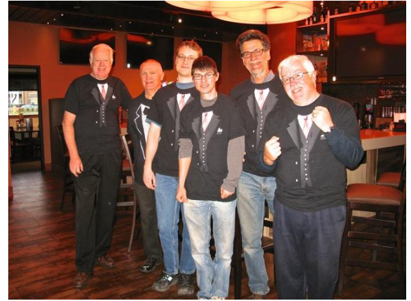
"The men of Churchill Park in all their finery ready to demonstrate their exemplary serving skills at Applebee's"